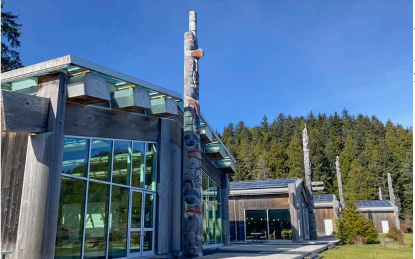
Haida Heritage Centre at Koy Limogay