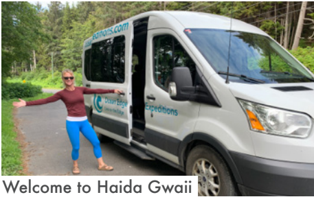
Welcome to Haida Gwaii