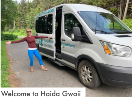
Welcome to Haida Gwaii