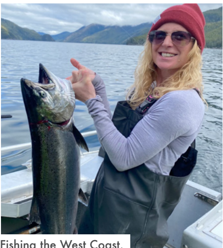
Fishing the West Coast.